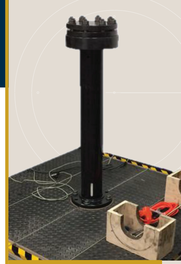
Flange Assembly Demonstration Unit

To schedule a training session or inquire about pricing, please contact: engineering@lamons.com